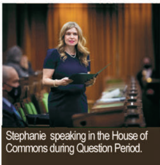
Stephanie speaking in the House of Commons during Question Period.

This closely-watched 45 minutes is also known as Question Period, or QP, and is what you would normally see on television. It is a chance for Opposition Members, and sometimes Members of the governing party, to seek information from the Government. By questioning the Prime Minister and the other Cabinet Ministers, Members call the government to account for its actions. QP is broadcast on the CPAC network Monday through Thursday at noon (MT) and at 9 a.m. (MT) on Fridays when the House of Commons is in session. (cpac.com)