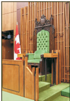
The Rhodes Chair serves as the Speaker's Chair in the temporary House of Commons Chamber in West Block.

Separate from their Parliamentary work, as members of a political party, MPs also play a role in the functioning of that party. Each riding has a local riding association (generally known as an EDA) which organizes political events and helps in election campaigns. These local associations also help manage memberships, fundraising and volunteer organization.