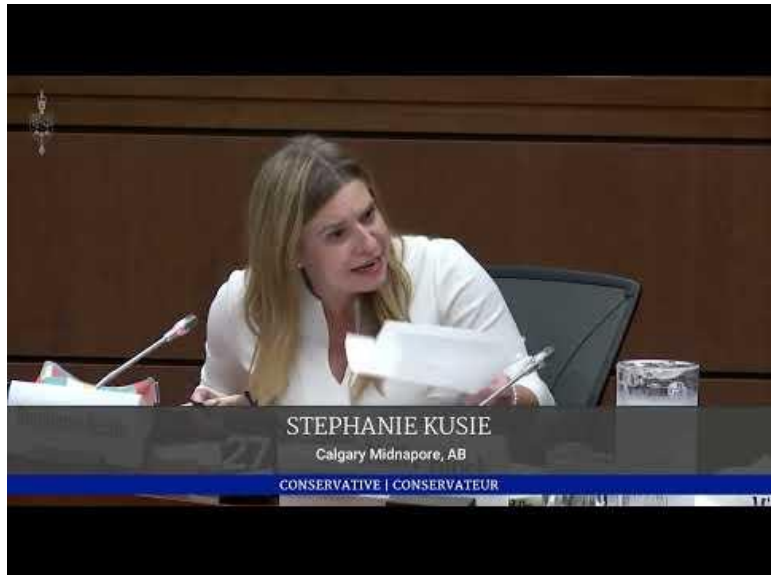
FEATURE VIDEO: "Redactions. Obstruction. Obfuscation..."