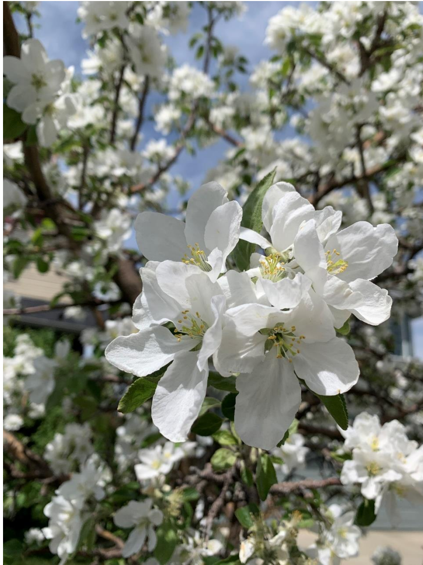
Apple blossoms in Somerset

Submit your photos of the riding to: stephanie.kusie.c1@parl.gc.ca