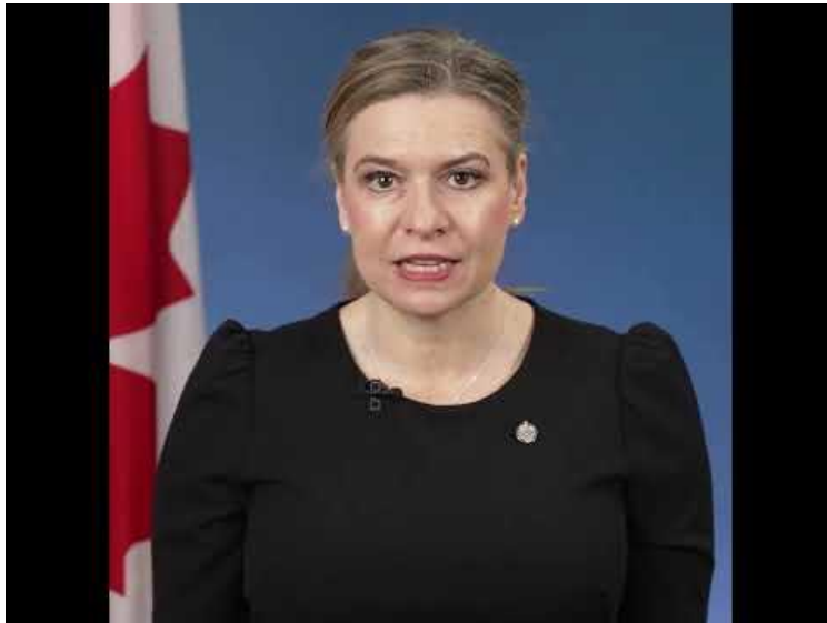
Featured Video: By the Numbers: Budget Bonanza 2023

McKinsey and Company passed the Integrity Regime...?