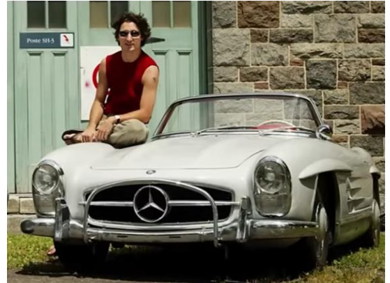
Featured Video: By the Numbers: Liberals living high on your dime